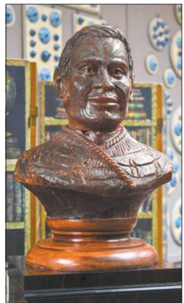
This large carved kauri gum bust of Māori Chief Tamati Tamaiwhakanehua, New Zealand, circa 1860, sold for $20,847.