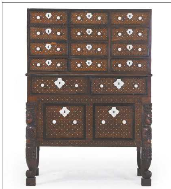
This Indo-Portuguese teak, rosewood, ebony and ivory contador cabinet, Goa, Seventeenth Century, took $19,110.