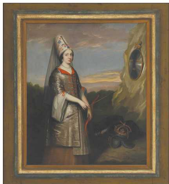
This Seventeenth Century North European School portrait of a lady earned $15,637.