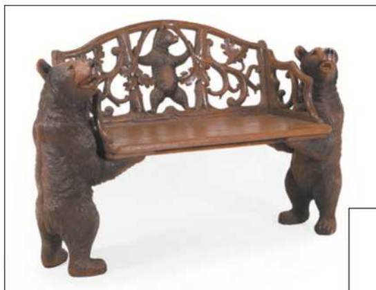
This Black Forest carved linden wood bench, Swiss, circa 1900, realized $12,162.

Review by Andrea Valluzzo, Editor