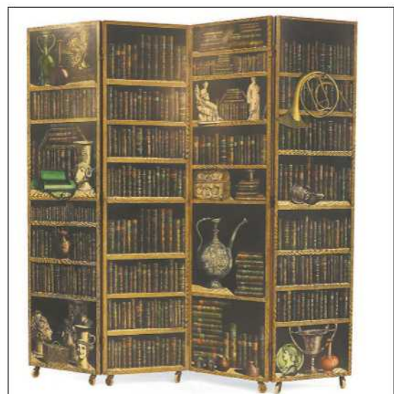
This Piero Fornasetti (Italian, 1913-1988) four-panel "Libreria" screen went out at $13,898.