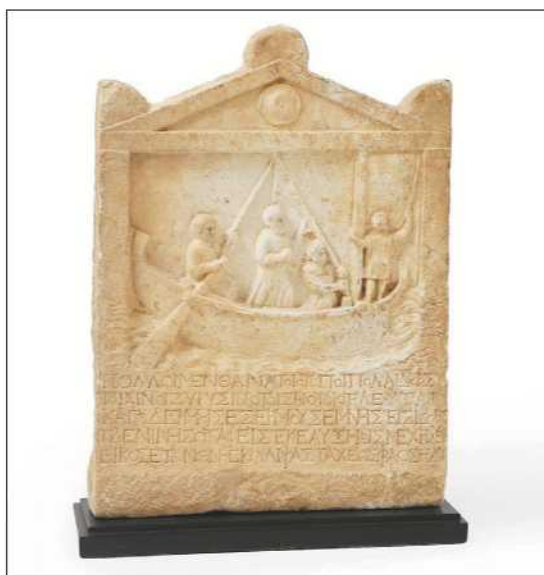
The top lot of the auction was a Greek marble funerary stele, Hellenistic period, Second to First Century BCE, which attained $33,000.