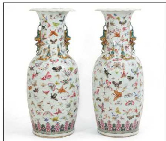
This pair of large Canton butterfly vases, Qing dynasty (1644-1911), Chinese, made $12,162.